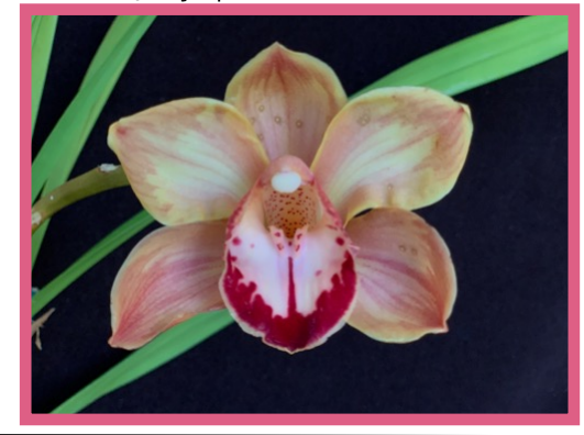
Cym. Persian Bronze 'Carmen'(from Rudvalis Orchids)

Snacks & Refreshments This month, all members with last names beginning O through S will share at break time! We appreciate everyone's effort in supplying our meeting with goodies. It makes for a great meeting all around! Thank you!