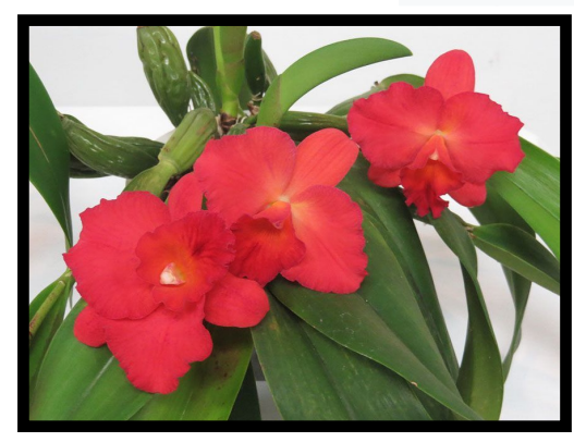
Meeting