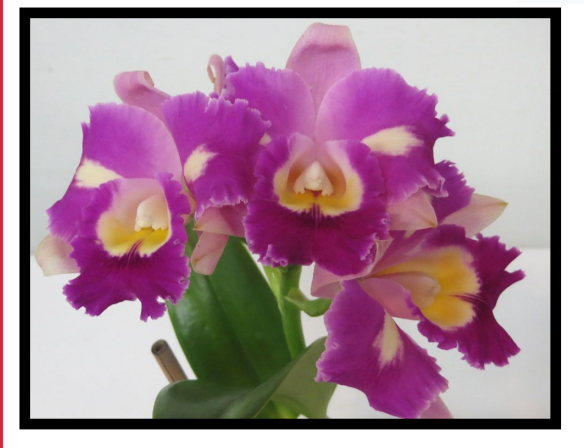
Bill's Lc. Tropical Song x L. anceps