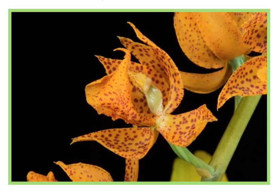
Mormodes Aftermath 'SVO Neon Blaster' AM/AOS