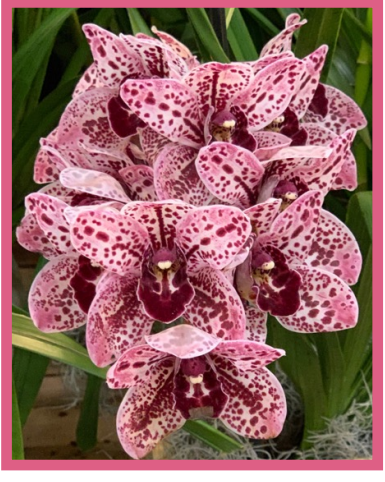
Cym. (Lotza Spots x Champaigne Pass)'Ambrosia' (from Casa de las Orquideas)