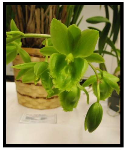
Alex's Fdk. Turning Point 'Green Goddess' x Ctsm. De Etta Harris 'Green Goddess'