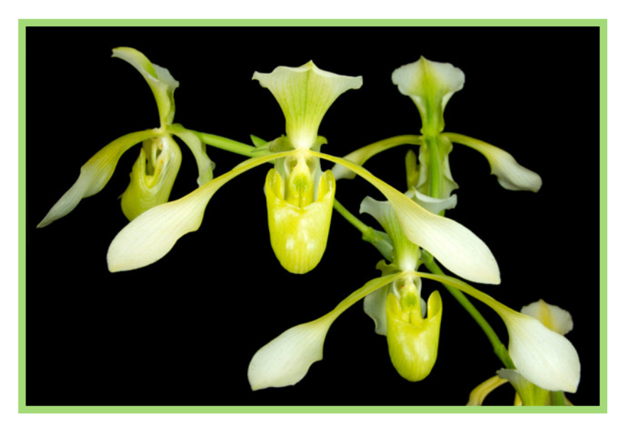
Paph Toni Semple 'Arnie' HCC /AOS