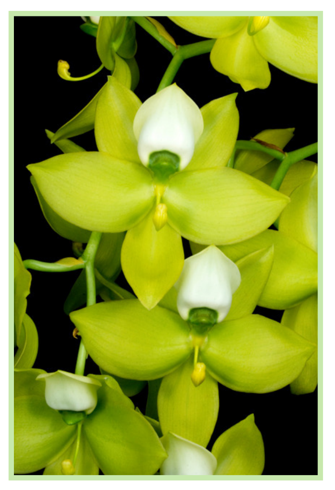
Cyc warszewiczii 'SVO Jumbo Super' AM/AOS

2019-20 CSA San Marino Judging Center Schedule Judging Cymbidiums, Paphiopedilums, Phragmipediums Huntington Botanical Gardens Mishler Resource Building 1151 Oxford Road, San Marino, CA 91108 12:30pm Registration 1:00pm Judging Next sessions are: Feb. 8, March 7 None, April 11, May 8, Aug. 9, Sept. 12, Oct. 10, Nov. 14, Dec. 12